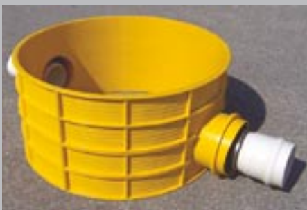
SEALPLATE with BOOT HUBS