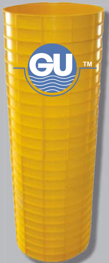
A Product by GU LINER SYSTEMS