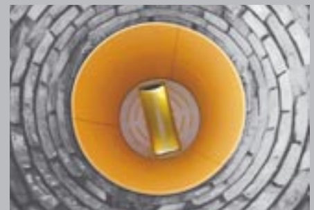
Rehabilitation with SEALPLATE